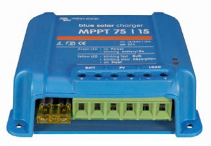
Solar Charge Controller MPPT 75/15