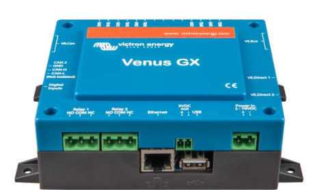
Venus GX front angle