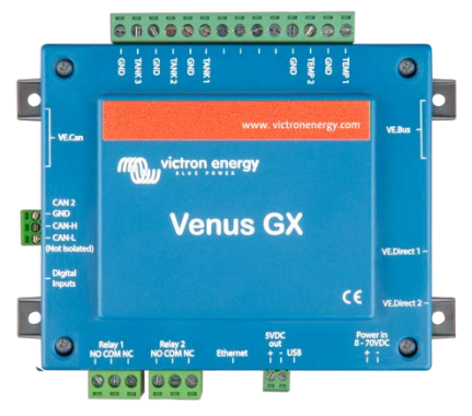
Venus GX with connectors