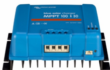
Solar Charge Controller MPPT 100/30