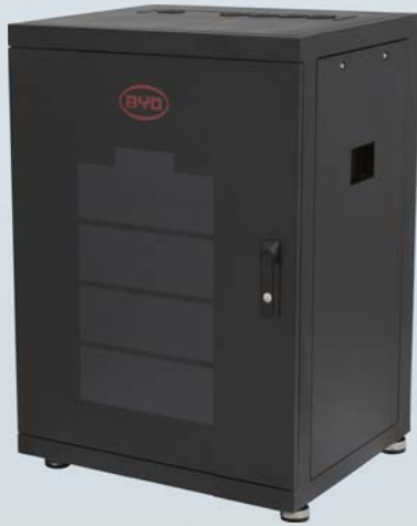
B-Box Pro 2.5~10.0