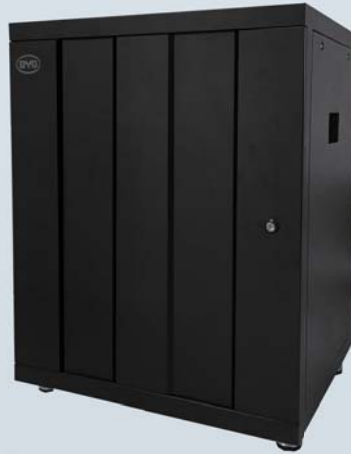
B-Box Pro 13.8